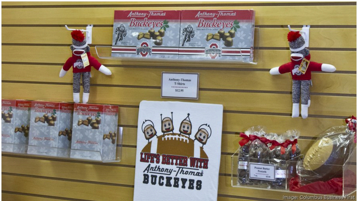
Anthony-Thomas Candy Co. makes Buckeyes and other chocolates at its plant at 1777 Arlingate Lane.